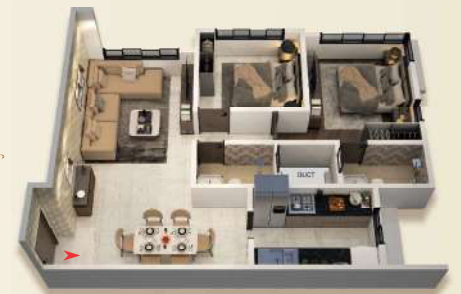
2 BHK FLAT

Disclaimer: Floor plan is for marketing purpose and is to be used as a guide only. Floor plan is intended to give a general indication of the proposed floor layout only and may vary in the finished building. All drawings/dimensions shown are for illustrative purposes only and may not be an accurate representation of final construction and are not intended to form part of any contract or warranty unless specifically incorporated in writing into the contract. Please ask our sales advisor for details of the treatments specified for individual Premises/Offices/Shops.