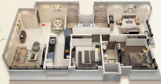
3 BHK FLAT

Disclaimer: Floor plan is for marketing purpose and is to be used as a guide only. Floor plan is intended to give a general indication of the proposed floor layout only and may vary in the finished building. All drawings/dimensions shown are for illustrative purposes only and may not be an accurate representation of final construction and are not intended to form part of any contract or warranty unless specifically incorporated in writing into the contract. Please ask our sales advisor for details of the treatments specified for individual Premises/Offices/Shops.