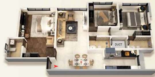
3 BHK FLAT

Disclaimer: Floor plan is for marketing purpose and is to be used as a guide only. Floor plan is intended to give a general indication of the proposed floor layout only and may vary in the finished building. All drawings/dimensions shown are for illustrative purposes only and may not be an accurate representation of final construction and are not intended to form part of any contract or warranty unless specifically incorporated in writing into the contract. Please ask our sales advisor for details of the treatments specified for individual Premises/Offices/Shops.