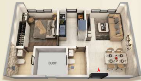
1 BHK FLAT